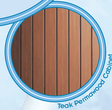
Teak PermaWood Cabinet