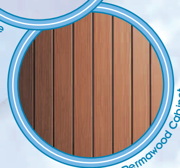
Teak PermaWood Cabinet